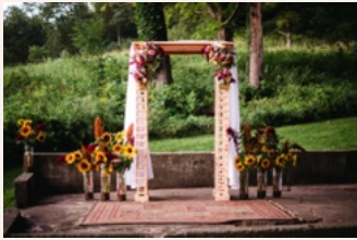
Erik Dutcher Photography

Please reach out to Flannery at flannerycerbin@gmail.com with questions or for pricing.